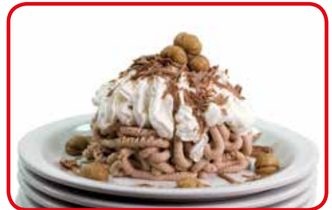
An example realized with "Spaghetti" mould