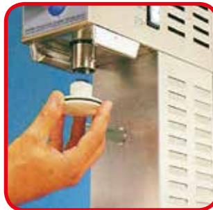
Easily removable Makrolon ® piston for a perfect cleaning