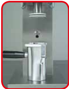
Anticorodal aluminium moulds. Spaghetti mould included