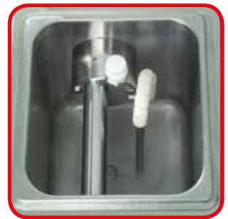
Directly refrigerated tank