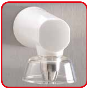
Stainless steel spout