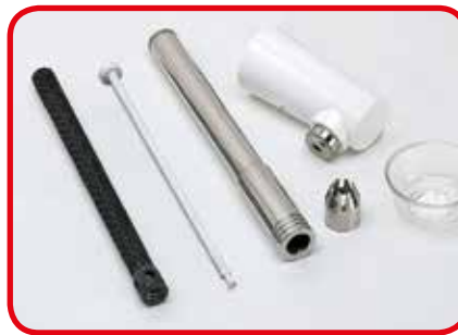
Removable components of the dispensing nozzle for perfect cleaning