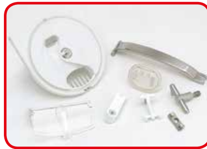
Complementary door is disassembled without the use of tools, for a perfect hygiene