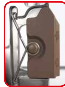
Interchangeable metal scrapers