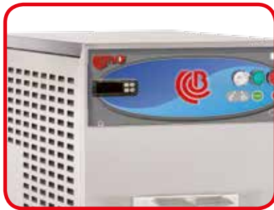
Thermo-regulator by display