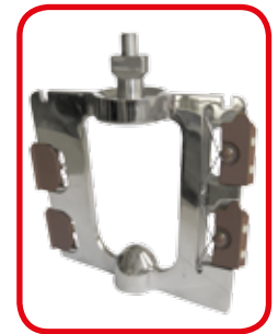
Two blade mixer